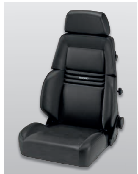
RECARO Expert S