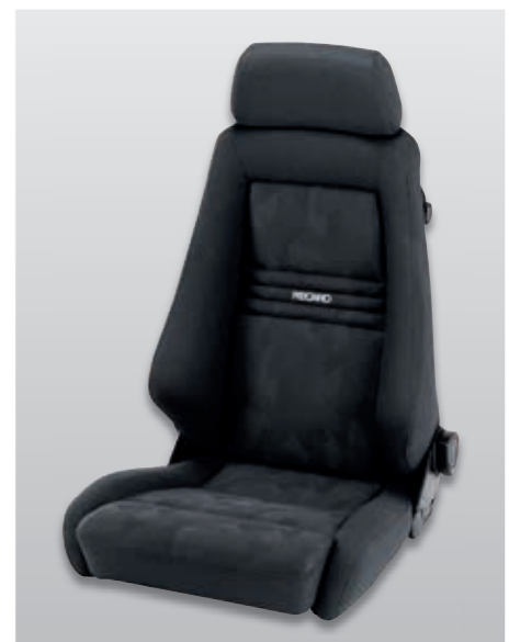
RECARO Specialist M