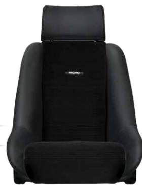
1967 RECARO RALLY I

In 1965, RECARO unveiled its sports seat at the International Motor Show in Frankfurt, revolutionizing car seating. Following soon after in 1967 came the first road-legal shell seat – the RECARO Rally. In 1974 we developed the Rally II, the first recliner shell seat for road use. Its successor the Rally III from 1979, and our Pole Position (ABE), launched in 2005, are still regarded as milestones in our shell seat development.