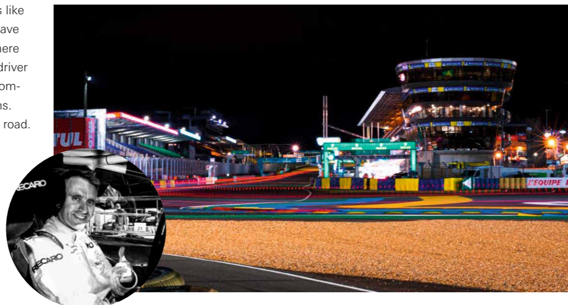
Timo Bernhard Team manager and professional racing driver 2 x winner, 24H Le Mans Winner of the American Le Mans Series and Petit Le Mans, 5 x winner of 24H Nürburgring

“My RECARO racing seat is not just reassuringly safe. It’s also consistently comfortable. It supports my whole body so I can perform at my best.”