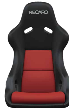
2005 RECARO POLE POSITION (ABE)