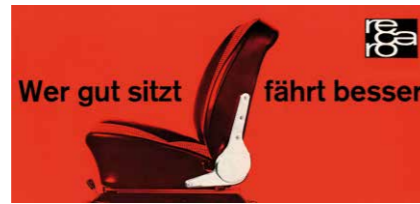
Our first ads under a new name.

In 1965, RECARO unveiled its sports seat at the International Motor Show in Frankfurt, revolutionizing car seating. Following soon after in 1967 came the first road-legal shell seat – the RECARO Rally. In 1974 we developed the Rally II, the first recliner shell seat for road use. Its successor the Rally III from 1979, and our Pole Position (ABE), launched in 2005, are still regarded as milestones in our shell seat development.