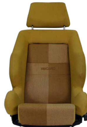
1979 RECARO RALLY III