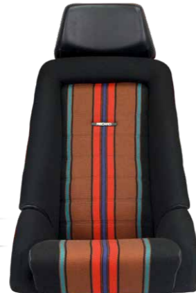
1974 RECARO RALLY II