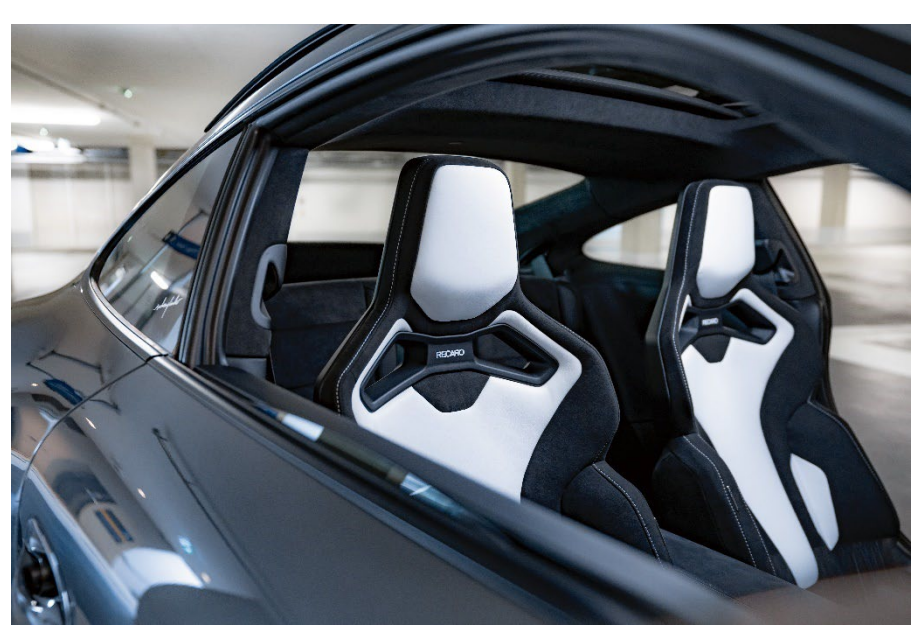
The new Recaro Sport C is the first aftermarket sport seat with fully electric 8-way mechanism. It successfully continues the tradition of the first "Sportsitz" from 1965.