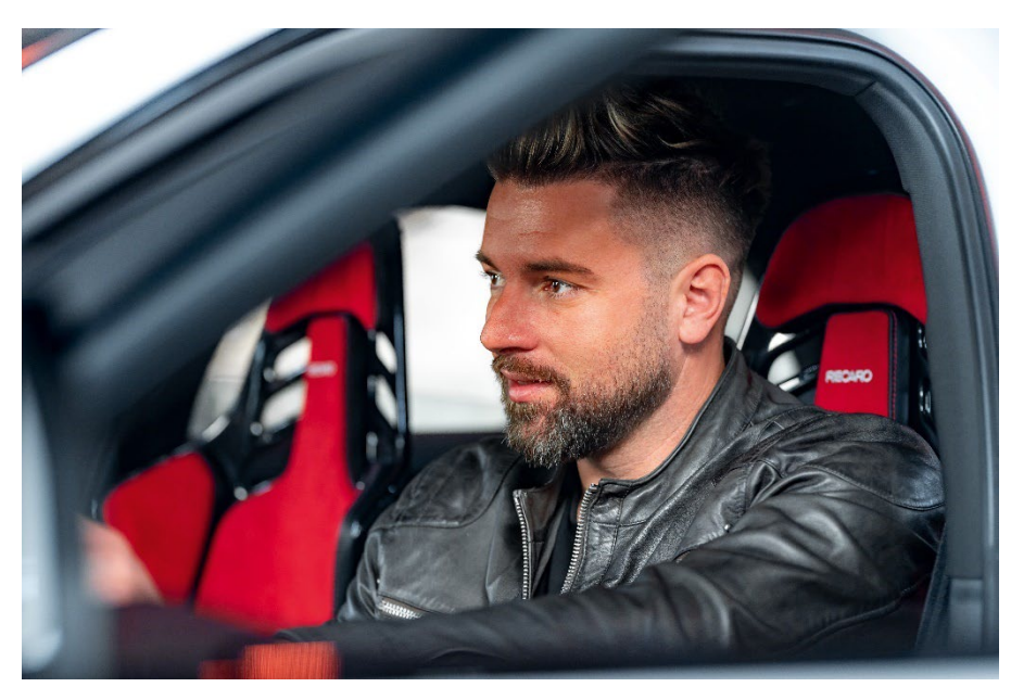
Recaro is expanding its portfolio with the Podium GF (with a shell made of glass-fiber-reinforced plastic, GFRP). Like its sister variant Podium CF (with a shell made of carbon fiber-reinforced polymer, CFRP), it has both an ABE rating and FIA homologation.