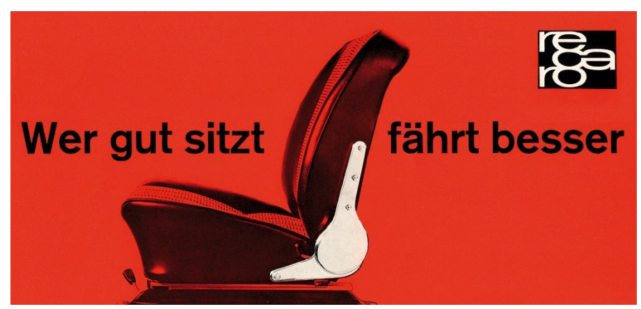
In 1963, Recaro focused entirely on the development and production of automotive seats. The company is celebrating this upcoming anniversary at the Essen Motor Show.

More information and download of images: https://www.recaro-automotive.com/en/recaro/press-media