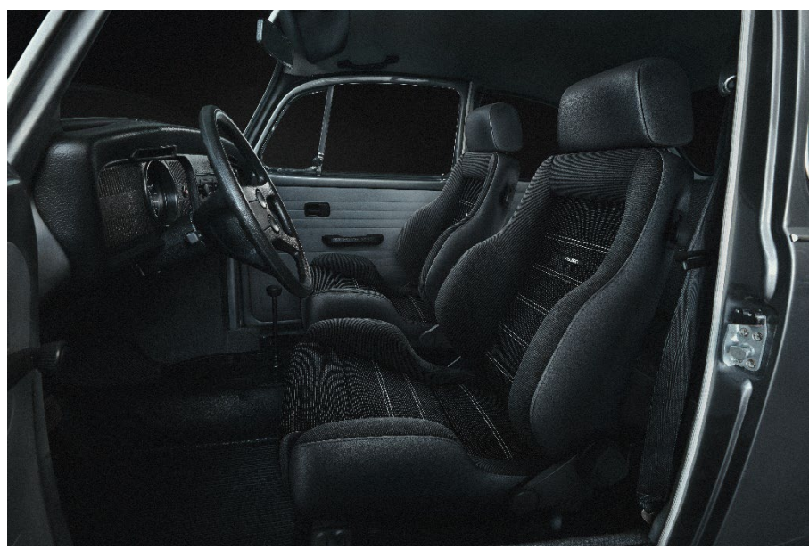
Just in time for the start of the Essen Motor Show, the Classic Line of automotive seats (with their iconic pepita, plaid and cube cord designs) is now available for online purchase from the official Recaro webshop shop.recaro-automotive.com).