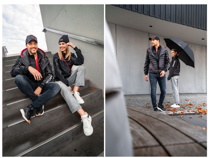
With a striking color combination of black and red, the Race Collection appeals to motorsport fans who want to be appropriately equipped around the race track, drivers' paddock and pit lane.