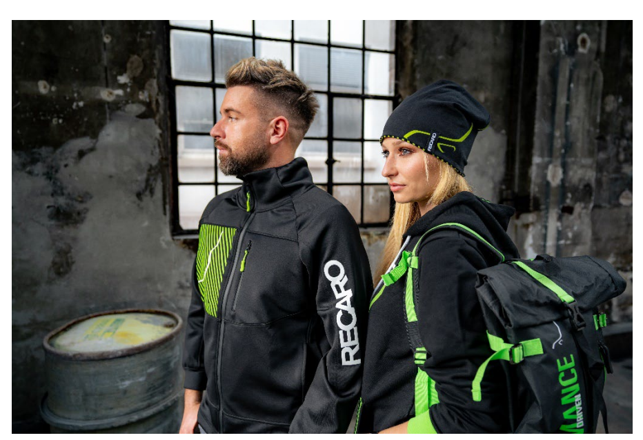
The Dynamic Collection uses the contour of the highly coveted Recaro Podium shell seat as a distinctive design feature.