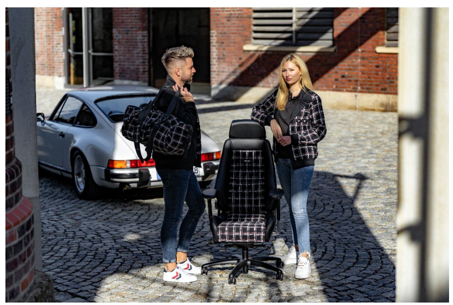
The Classic Line lifestyle products are inspired by the iconic Recaro design of the past (here: checked pattern) and bear the "Approved by Walter Röhrl" seal of quality.