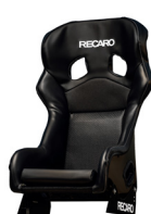
RECARO Pro Racer SPG XL ORV