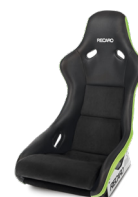
RECARO Pole Position (ABE)