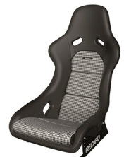
RECARO Classic Pole Position (ABE)