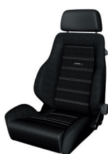
RECARO Classic LS