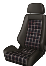
RECARO Classic LX