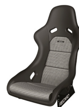
RECARO Classic Pole Position (ABE)