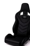
RECARO Sportster GT