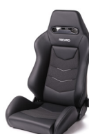
RECARO Speed V