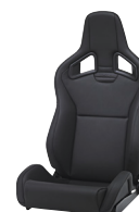
RECARO Sportster CS