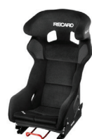
RECARO Pro Racer SPG, SPG XL

• Standard features, ○ Option/accessories