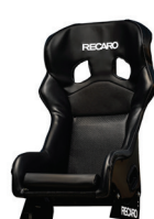
RECARO Pro Racer SPG XL ORV