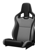
RECARO Cross Sportster ORV