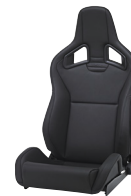
RECARO Sportster CS