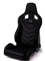
RECARO Sportster GT