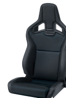
RECARO Cross Sportster CS