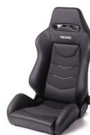
RECARO Speed V